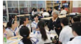
Star Talks 名人分享會