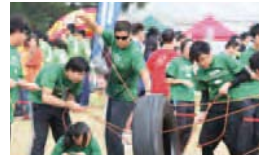
Outward Bound 外展訓練