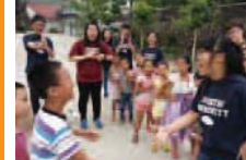
Volunteering in China 國內義工服務