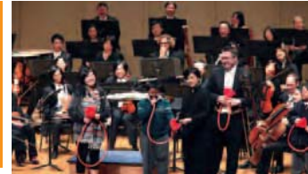
Music Appreciation 交響樂欣賞會