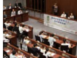
Mini LegCo 模擬立法會